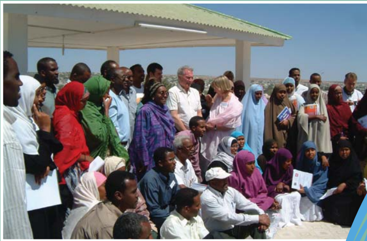
Group photo of those who partook a Life Saving Skills Essential Obstetric and Newborn Care course in Swaziland.